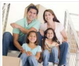
Photo: Latino Family Click Here to Enlarge Photo

Some call it the "Hispanic Mortality Paradox" – U.S. Latinos outliving whites while they are most likely to be uninsured and live in poverty- stricken areas.